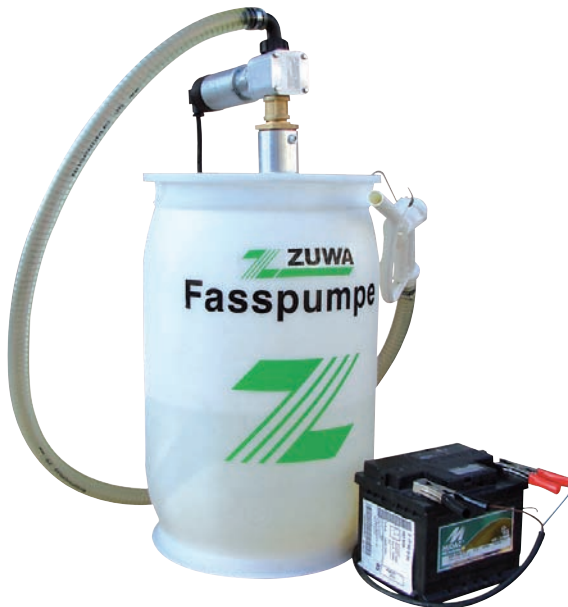
ZUWA barrel pump *

Highly functional: driving the pump with cordless drill or screwdriver.