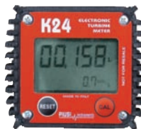
flow meter K24 (on option)