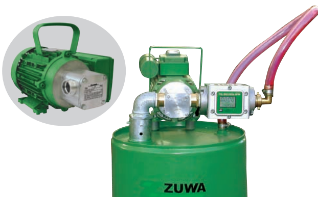
ZUWA barrel pump *

This high quality, dry self-priming impeller pump is suitable for all kinds of non-abrasive and non-corrosive fluids – particularly for oils and diesel. With the flexible impeller wheel the pump is insensitive to solids within the fluid. The pump is capable of draining barrels down to the last drop. Different flow meters optionally available.