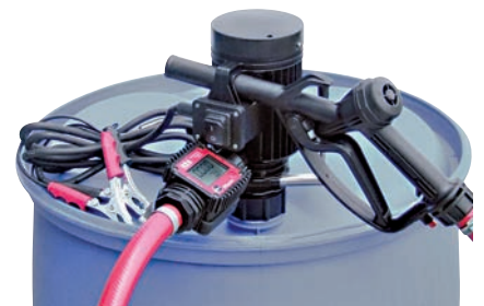
barrel pump for battery drive including 3 m cable and clamps