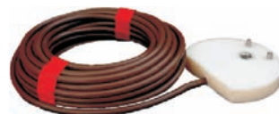
Sensor switch with cable