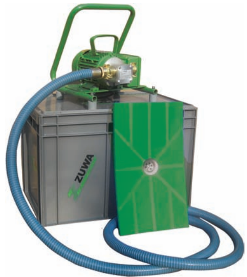
Oil suction kit (mat not included)