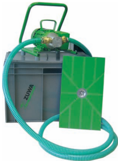
Suction kit KOMPAKT