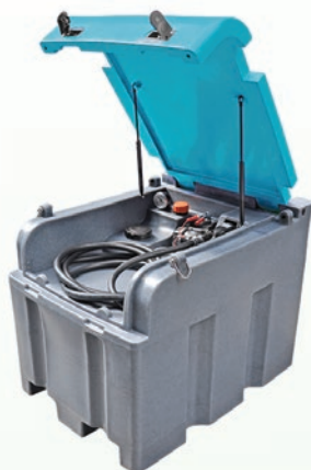
Mobile Tank for AdBlue 400l