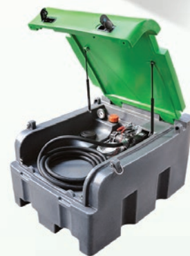
Mobile Tank Diesel 200l