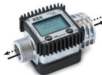
digital flow meter K24