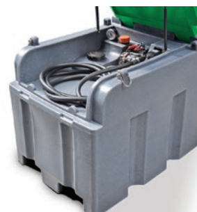
large tank interior